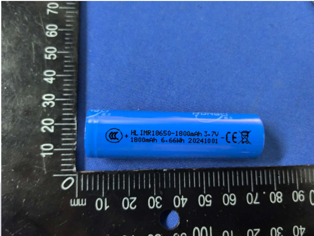
Picture 1. Front view of cell 图片 1. 电池前视图